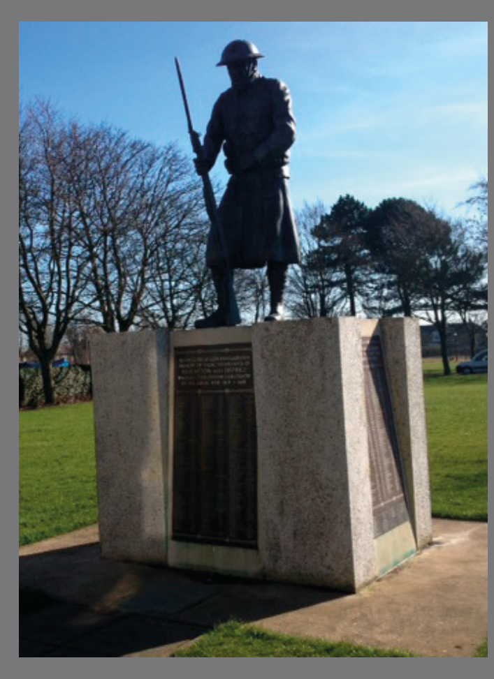
Ashington War Memorial Kenilworth Road, Ashington in 2014.

The Ashington War Memorial honours over 1,000 people from the town who gave their lives in the two World Wars. In addition, a Memorial recognising service in conflicts after 1945 is also centrally placed within the Garden.