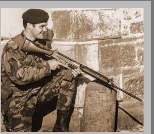
Northern Ireland, 1968-98