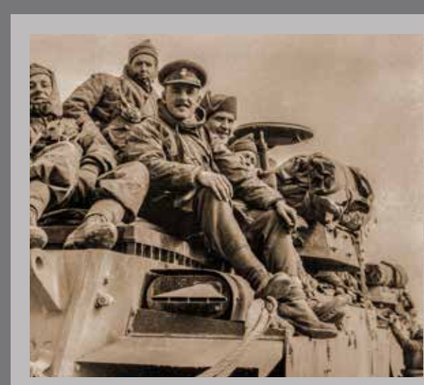
The Korean War, c1950

For example, fighting in Malaya (1948-60) claimed 1,443 British lives and 1,129 died in the Korean War (1950-53). The Northern Ireland 'Troubles' (1968-98) resulted in the deaths of 1,441 members of our Armed Forces.