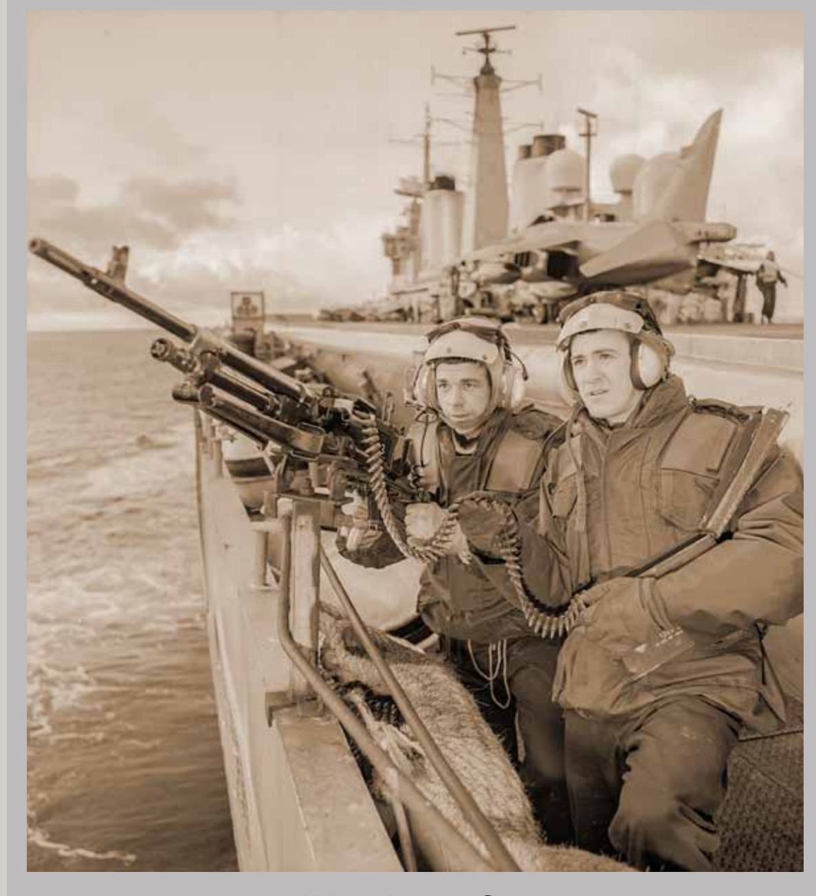
The Falklands Conflict, 1982 Gun crew at the ready on the aircraft carrier HMS Invincible.

1968 is the only year since 1945 when no British service personnel have been killed in conflict