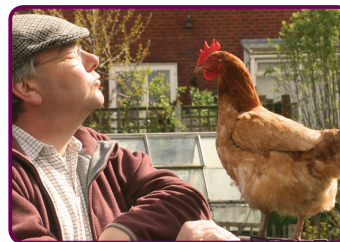
Credited to Holly Raper.

Make sure the run is well protected with two metre high chicken wire fencing, with an outward facing flange of fencing laid on the ground to prevent