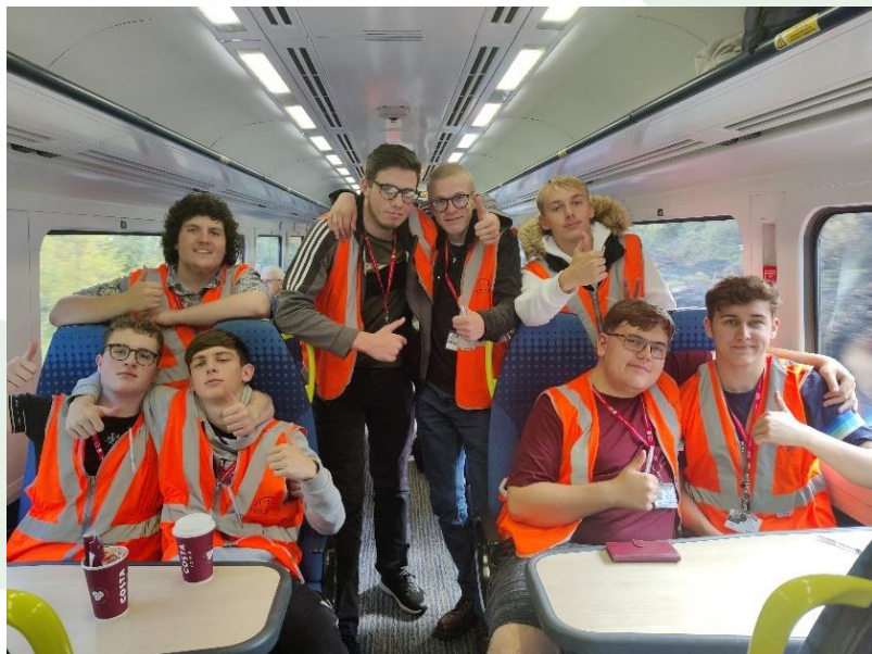
Students from Gateshead College on one of the Special Services