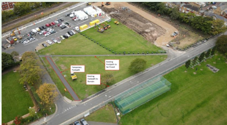
Location of temporary footpath

A drop-in event at Ashington will take place in the next couple of months, and further details will be included in the next edition of this newsletter.