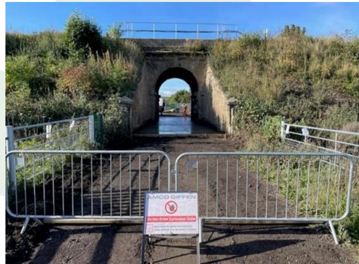
Underpass works being completed between Seaton Delaval and Newsham

Works are also currently underway to repair and upgrade an underpass between Seaton Delaval and Newsham, near Lysdon Farm. This work is due to be completed in early December.