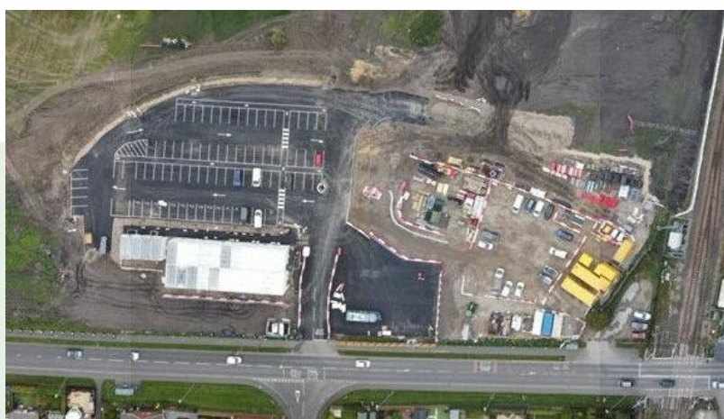
Aerial view of the works taking place at Newsham station

Welcome to the October 2022 edition of the Northumberland Line newsletter. The aim of this is to give an overview of upcoming site work, as well as letting you know about key project milestones.