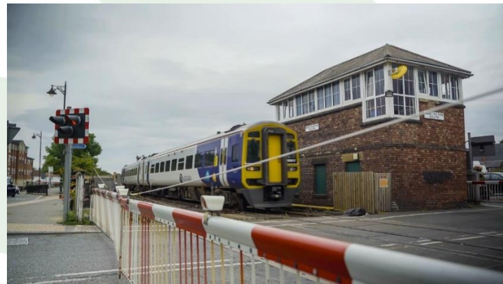
Northern Train on the Northumberland Line

All 20 drivers required to operate Northumberland Line services have now been recruited by Northern and are going through the relevant training. Some of the earlier trainees have now had their initial passing out and driving services ahead of gaining their full driver competencies.