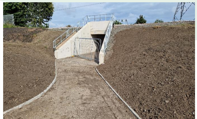
Underpass during the works

Contractors AmcoGiffen have completed the works to repair and upgrade two underpasses in the Backworth area. These new structures will provide safe pedestrian routes underneath the railway lines, which will be much busier once Northumberland Line services begin.