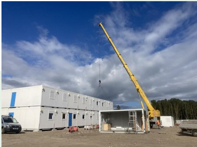
Site cabins at Newsham Station compound

The main site compound has now been completed at the Newsham Station site. Site cabins have been installed, for the team to use as office spaces and welfare. Additional smaller satellite temporary compounds will be located elsewhere along the route, as and when required.