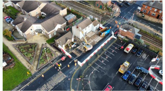
The former Boots building, before demolition

The former Boots building in Bedlington has been demolished to allow for works associated with the new station. Over the course of two weekends in October, Morgan Sindall carefully managed the demolition of the structure. This involved using a large mechanical excavator, with the structure carefully reduced to the ground and all demolition material removed from the site.