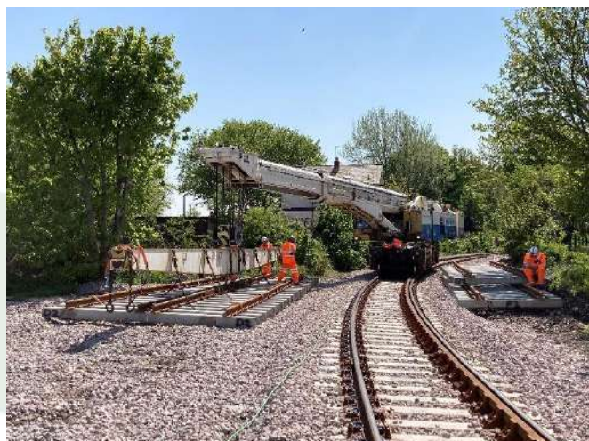
Installation of new track crossing panel at Redhouse Junction

Welcome to the May 2023 edition of the Northumberland Line newsletter. The aim of this newsletter is to give an overview of upcoming site work, as well as letting you know about key project milestones.