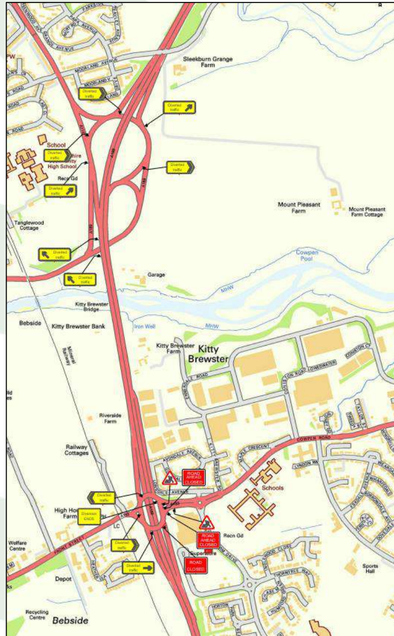
Map showing the agreed diversion route for southbound A189 traffic during overnight closures.

The slip road will be open at weekends as normal.