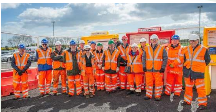
Representatives from the Institution of Civil Engineers visit the site of the new Newsham Station

Alternatively, if you would prefer to have a paper copy delivered to your doorstep, please let us know by calling 0345 600 6400 or email rail@northumberland.gov.uk .